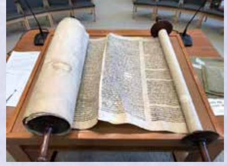
Beth El's Holocaust Torah

On December 3, Beth El will commemorate the 75th anniversary of the final deportation of the community that owned its Holocaust Torah . To preview the event, this course will discuss the Beth El Holocaust Torah 's beginnings in the Jewish community of Hermanuv Mestec, a town in the Pardubice Region of the Czech Republic, which can be traced to the 15th Century. We shall learn about the Torah 's rescue through the renowned Westminster Project that saved almost 1600 Holocaust Torahs . We shall also learn about the importance of this