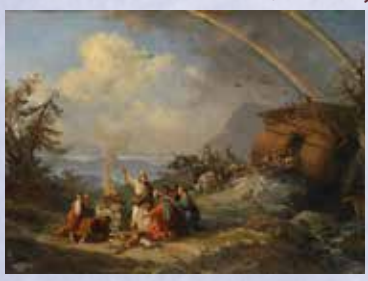
Dankgebet nach Verlassen der Arche Noah (1901), Domenico Morelli