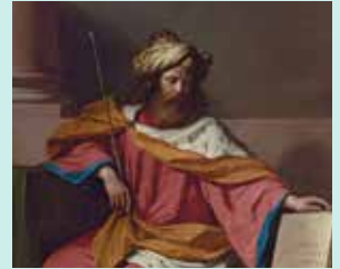
King David , Guercino, 1651 (oil on canvas). Wikimedia commons.

The ways in which we have thought and written about politics, human power, and the dispensing of justice have been deeply shaped by the Hebrew Bible. The Hebrew Bible's teachings on political order and authority are complex and sometimes contradictory, recognizing the basic human need for order as well as the dangers of centralized power and of those who wield it. Can human beings live together under a revealed law, or do they require stable and ongoing political order administered by human beings? Is monarchy the legitimate political order or a rejection of divine authority? A close and careful reading of the Biblical narrative reveals not only the fragility of human beings but also of their political institutions.