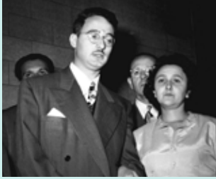
Julius and Ethel Rosenberg arrested, Encyclopedia Britannica