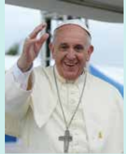
Pope Francis