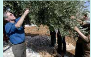
Amos Oz picks olives with Palestinian women in the West Bank village of Aqraba on October 30, 2002, as protest against increasing violence

Israel is going through a period of turmoil, with four election cycles in just two years and a growing sense of division among its diverse population. In a series of lectures about the “modern tribes” that make up Israeli society, award-winning Haaretz journalist Amir Tibon will describe the “challenge of division” that several of the Jewish state’s most high-ranking generals and spy masters describe as a bigger threat to Israel’s long-term security than any external enemy. The sessions will touch on issues such as: the country’s election system and why it leads to constant instability; the positive and negative trends among Israel’s Arab population; the legacy of Israel’s greatest author, Amos Oz; and also a personal reflection about life on Israel’s tense border with Gaza. Amir will share stories, anecdotes, data, and historical details that will explain Israel’s current dilemmas and also its great potential and promising opportunities.