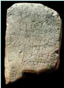
The Gezer Calendar, one of the oldest examples of paleo-Hebrew script