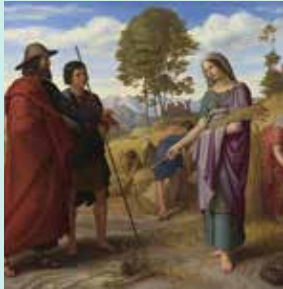
Ruth in Boaz's Field , Julius Schnorr von Carolsfeld, 1828 (oil on canvas).

Instructor: Gideon Amir , Tuesday morning and Wednesday evening